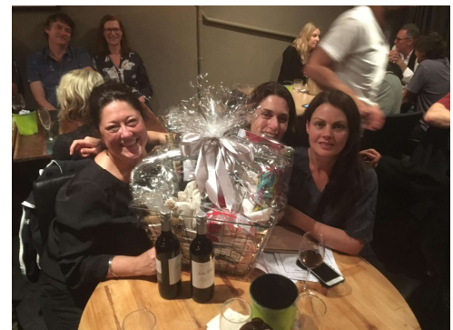
Quiz night 1 st Prize winners!!!

Have you paid the voluntary contribution of $60.00 to the P & C this year? If not please see the admin office.